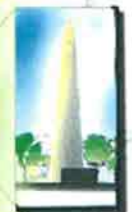
The Monument at Colony Park